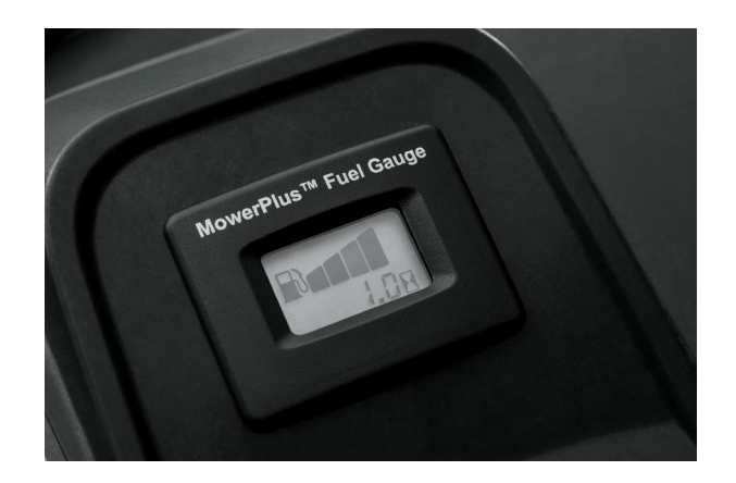
Easy read fuel gauge