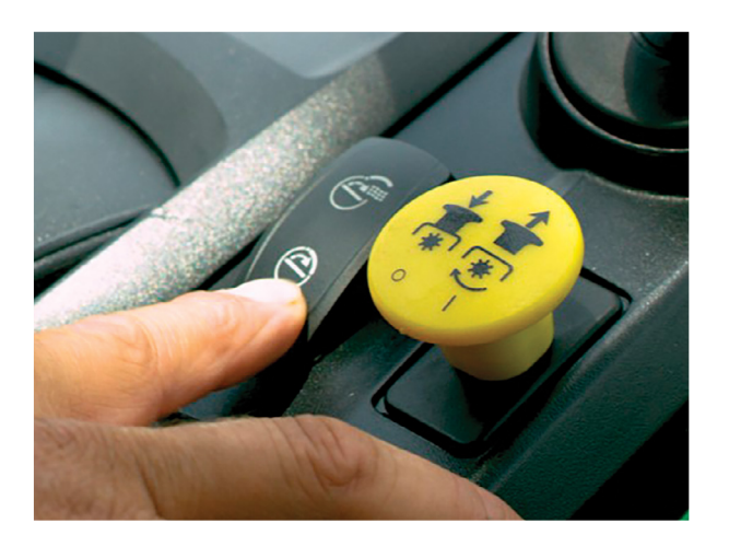
MulchControl™ Kit with One Touch Technology

Cut grass clippings down to size, so they are easily absorbed in your lawn. Or side discharge or bag.