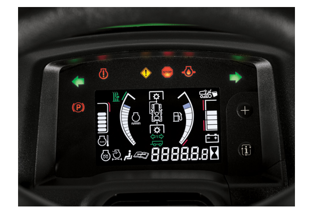
The dashboard approach — Electronic Fuel Gauge. Engine Temperature Gauge. Tachometer with Best Cut Target Zone. An Electric Power Take-Off (PTO) engagement indicator. All at a glance and within easy reach.