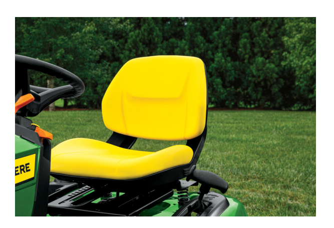
38 cm seat

(available on S110, S120, S130, S140, X147R and X167R)