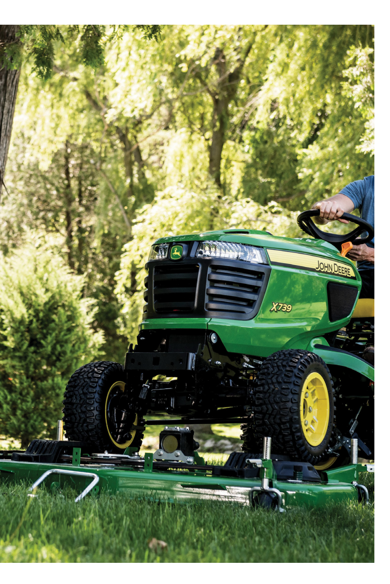
With an AutoConnect deck, attaching and removing your mower deck is easier than ever. Drive over ramps can quickly be removed, without tools, for access to mower deck.

BUMPER-TO-BUMPER 4-YEAR /700-HOUR WARRANTY"