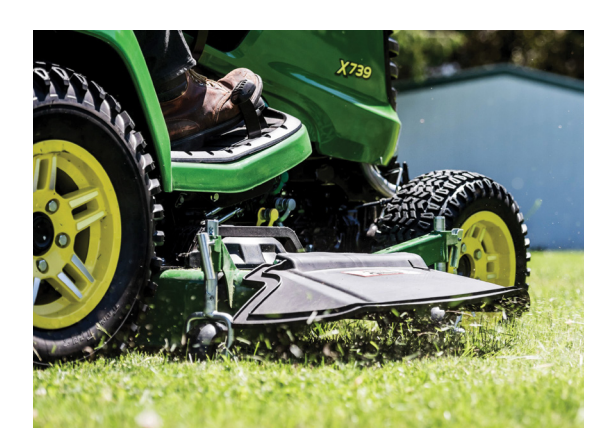
A high-capacity mower deck, solid stamped out of 9-gauge steel to handle the tall stuff.