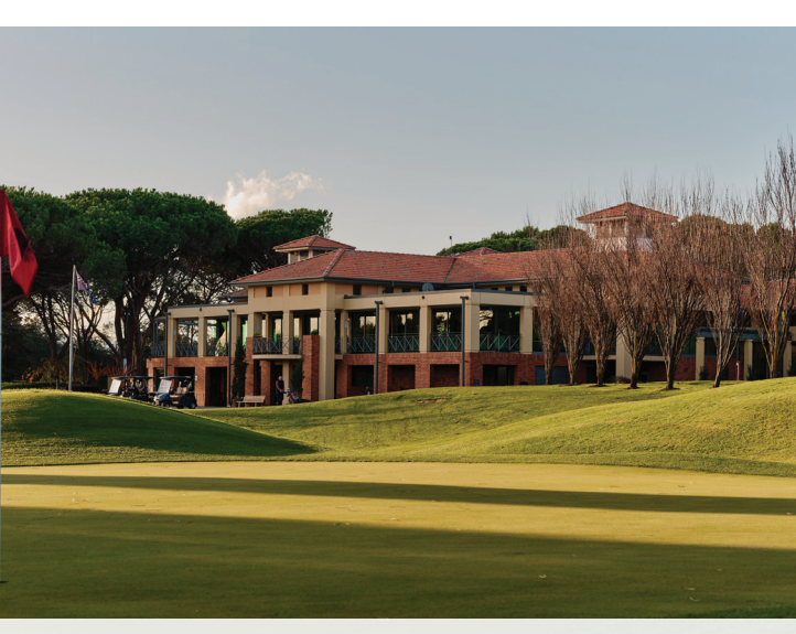
Royal Canberra Golf Course is considered the jewel in the golfing crown of the nation's capital.