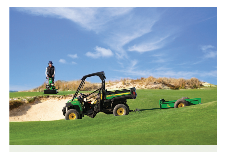
Tara Iti Golf Course, Te Arai coast, North Island.

"It's almost impossible for human beings to create contours as varied as what nature provides us on a true links, so we try not to disturb those more than we have to.