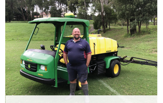
The Southport School, Gold Coast, Queensland.

"The precision of the unit, in applying product, whatever it may be, is obviously just going to pay dividends for us in the long run by reducing the overspray and missed spots you'd normally see with the old marking systems," he said.