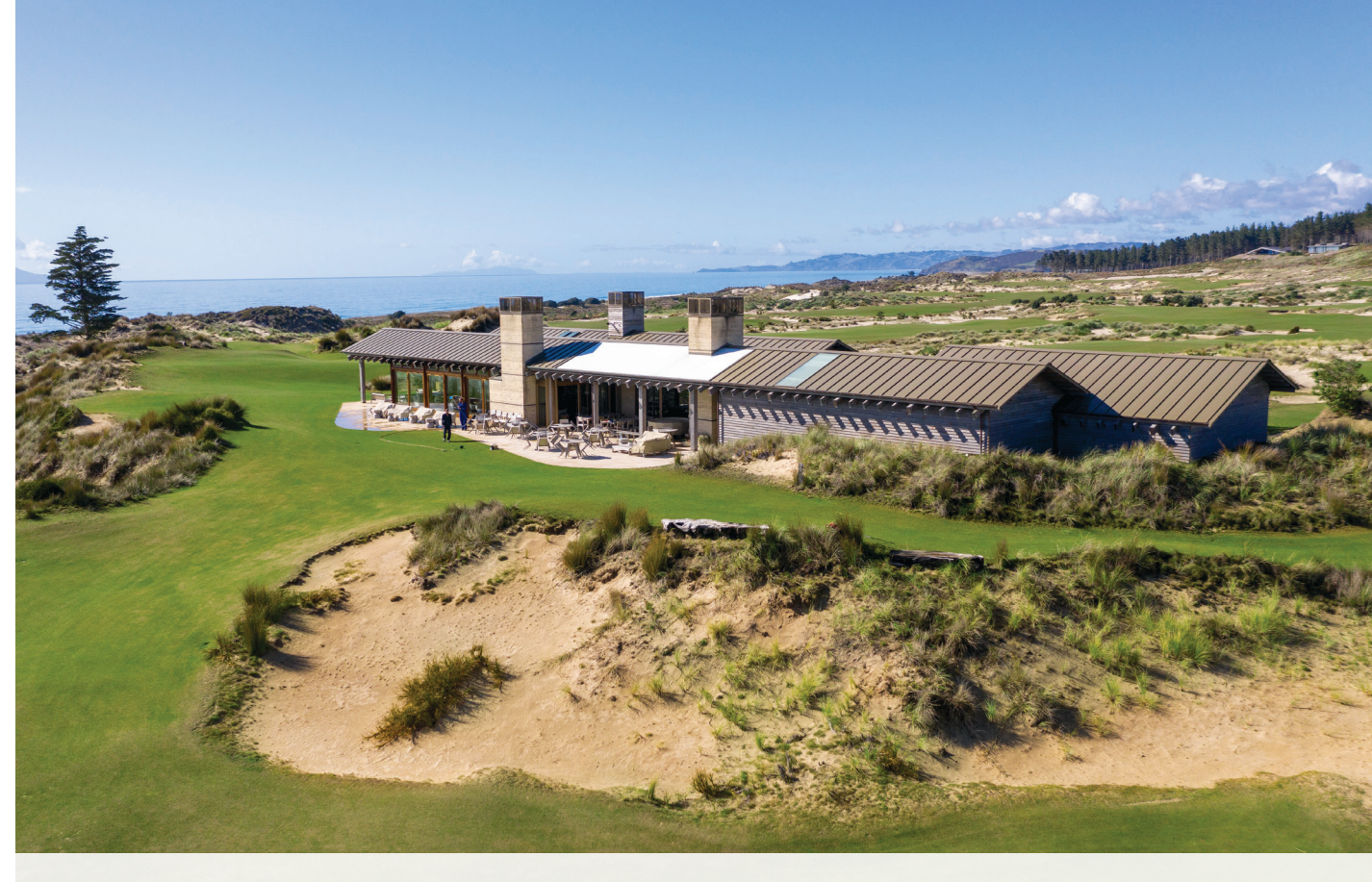
US-based Tom Doak designed Tara Iti Golf Course using the natural terrain.

"We always have to remember that the combination of wind and contour can be so challenging that you don't need a lot of other features to back them up."