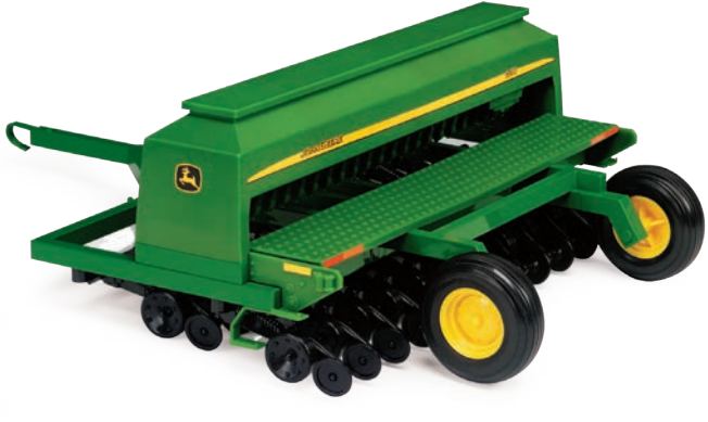
1:16 1590 GRAIN DRILL 45430 - Pack: 4