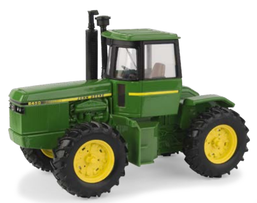
1:32 8450 TRACTOR 45586 - Pack: 3 Age grade: 3+