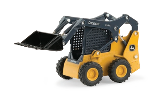
1:32 314G SKID STEER 45562 – Pack: 6