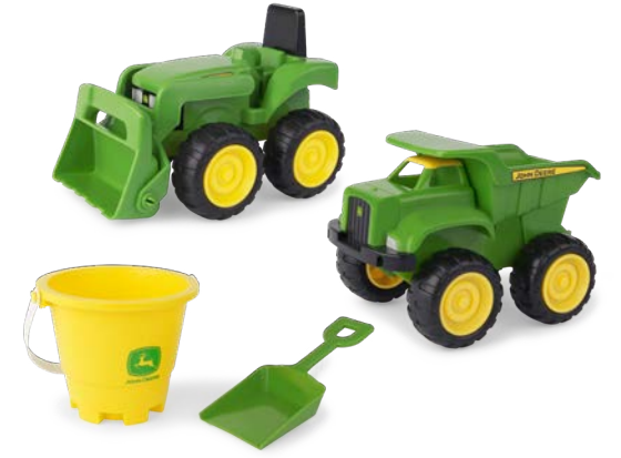
15 CM VALUE SET WITH BUCKET 46745 - Pack: 4