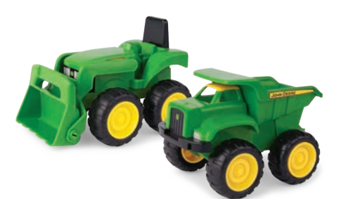
15 CM PLASTIC SAND PIT VEHICLE ASSORTMENT 37558 - Pack: 4 Age grade 18 mos+. SRRP: $9.95 FACH