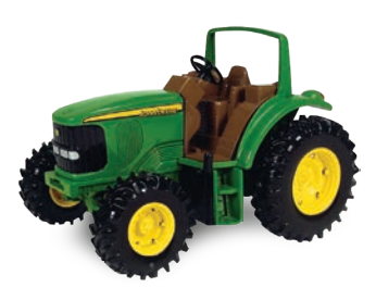
28 CM TOUGH TRACTOR 35024 - Pack: 2