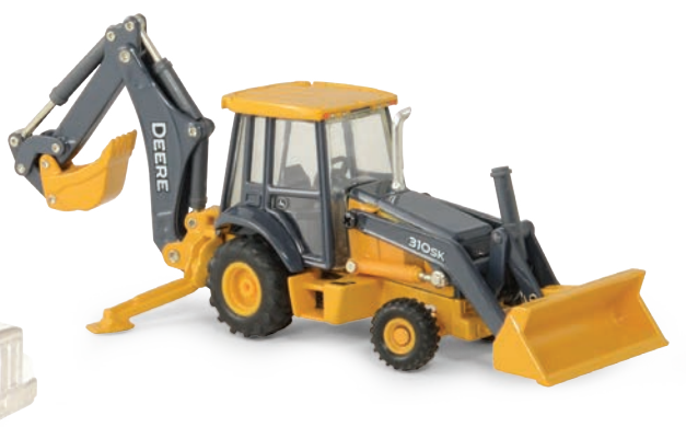
1:50 310SK BACKHOE LOADER 45456 - Pack: 6