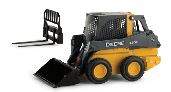
1:16 320E SKID STEER LOADER