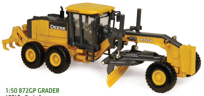
1:50 872GP GRADE 45049 - Pack: 6 Age grade 14+. SRRP: $49.95 EACH