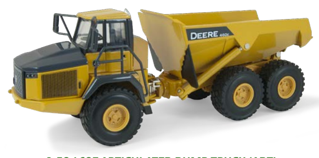
1:50 460E ARTICULATED DUMP TRUCK (ADT) 45366 - Pack: 6