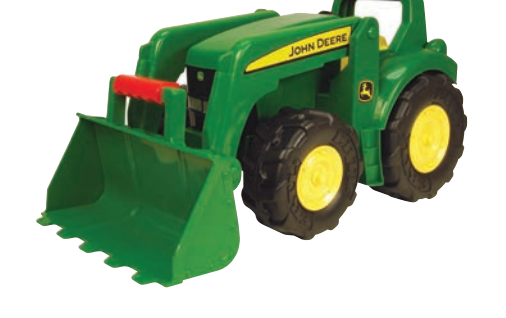
53 CM BIG SCOOP TRACTOR WITH LOADER