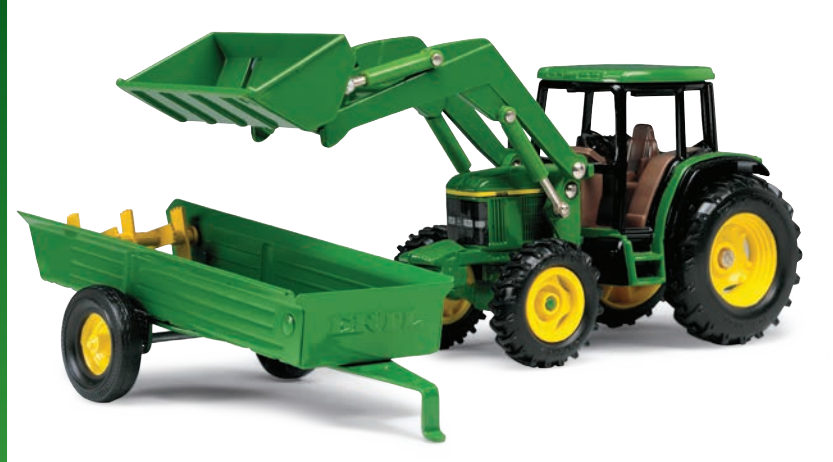
1:32 6210 TRACTOR WITH LOADER & MANURE SPREADER 15488 - Pack: 6 Age grade: 3+ SRRP: $59.95 EACH