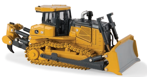
1:50 1050K DOZER 45515 - Pack: 6 Age grade 14+. SRRP: $74. 95 EACH