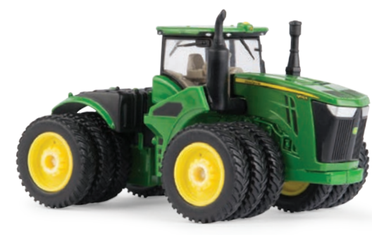
1:64 9570R TRACTOR 45509 - Pack: 12 Age grade 3+. SRRP: $24. 95 EACH