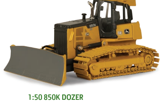
45264 - Pack: 6 Age grade 14+.