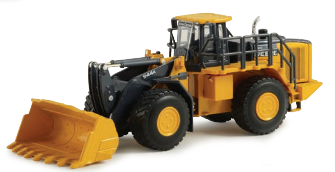
1:50 944K WHEEL LOADER 45250 - Pack: 6 Age grade 14+. SRRP: $49. 95 EACH