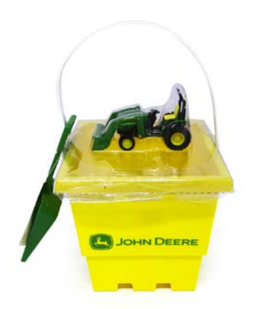
JOHN DEERE VEHICLE BUCKET & SPADE SET