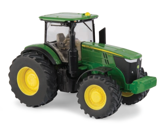
1:32 7310R TRACTOR 45637 - Pack: 3 Age grade: 3+