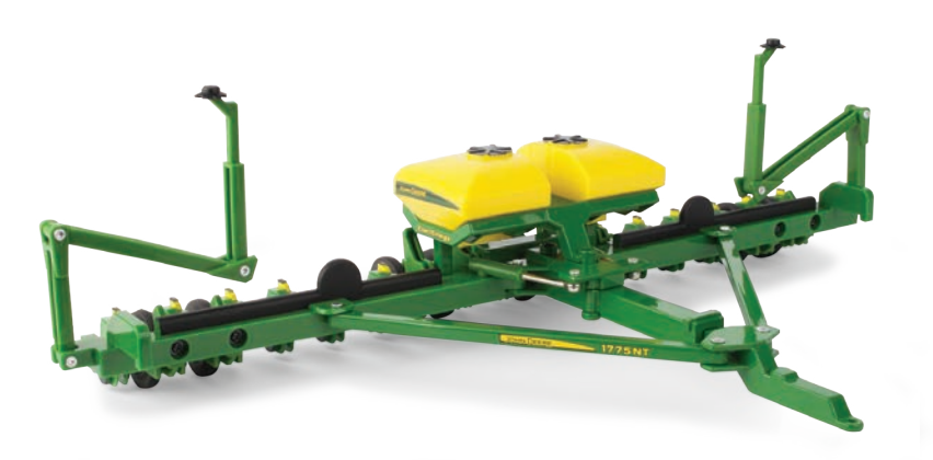
1:32 1775 NT PLANTER 45585 - Pack: 3 Age grade 3+. SRRP: $49. 95 EACH